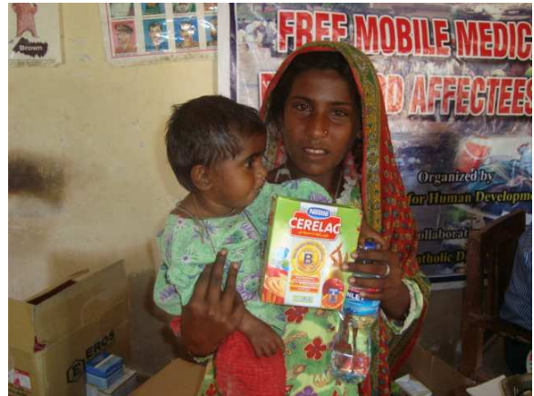
Girl is happy to receives nutritious food (Cereal) for her sister