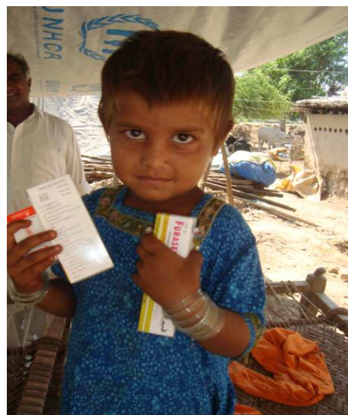
Girl is happy with her medicines