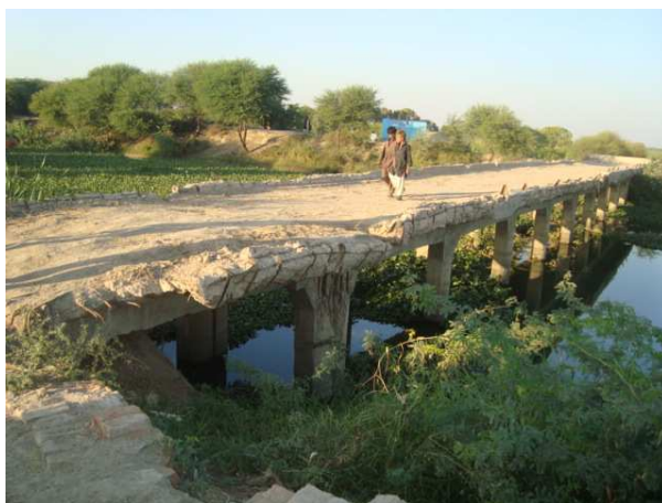
This dangerous bridge is the only way to visit Flood affected people of Deh Buddha & other villages in Jati.